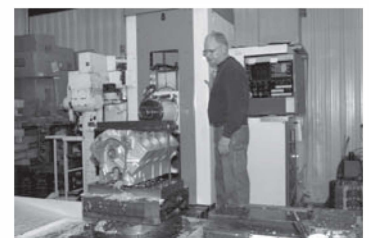
CNC Block Machining