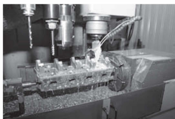
CNC Head Machining