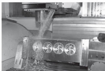
5 Axis CNC Porting