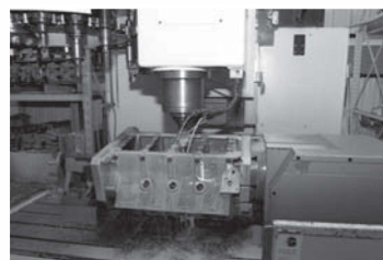
CNC Block Machining